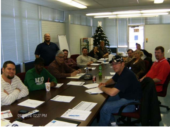
Brutus/BW/Boxer offsite Steering Team meeting.